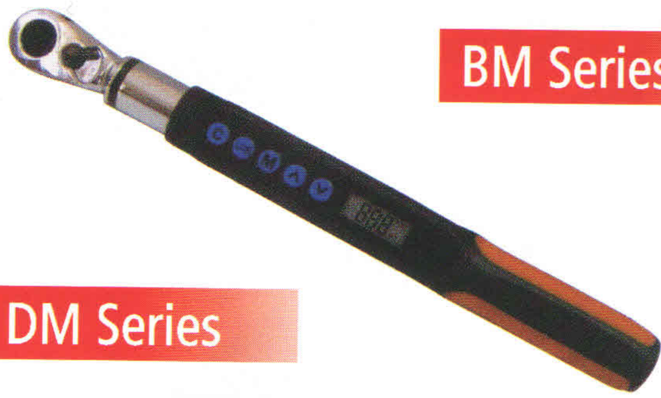
BM Series (Bits)